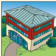
At your office ...

PROS: Live digital feed and 24/7 Internet access for the next six months; accessible in the office, at home or anywhere worldwide with Internet access; avoid travel expense and hassle; no time away from the office.