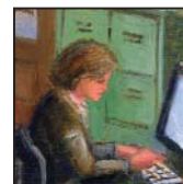
At your office ...

The archived conference includes speaker videos and coordinated PowerPoint presentations.